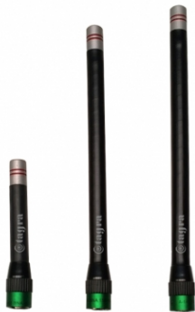
Different models available